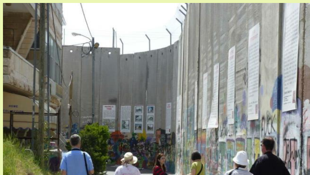
The reality of some parts of Bethlehem – as experienced by pilgrims from the Leeds Diocese in 2013

Sat 26 September 10:30 – 1:30pm Oxford Place Centre Oxford Place Leeds